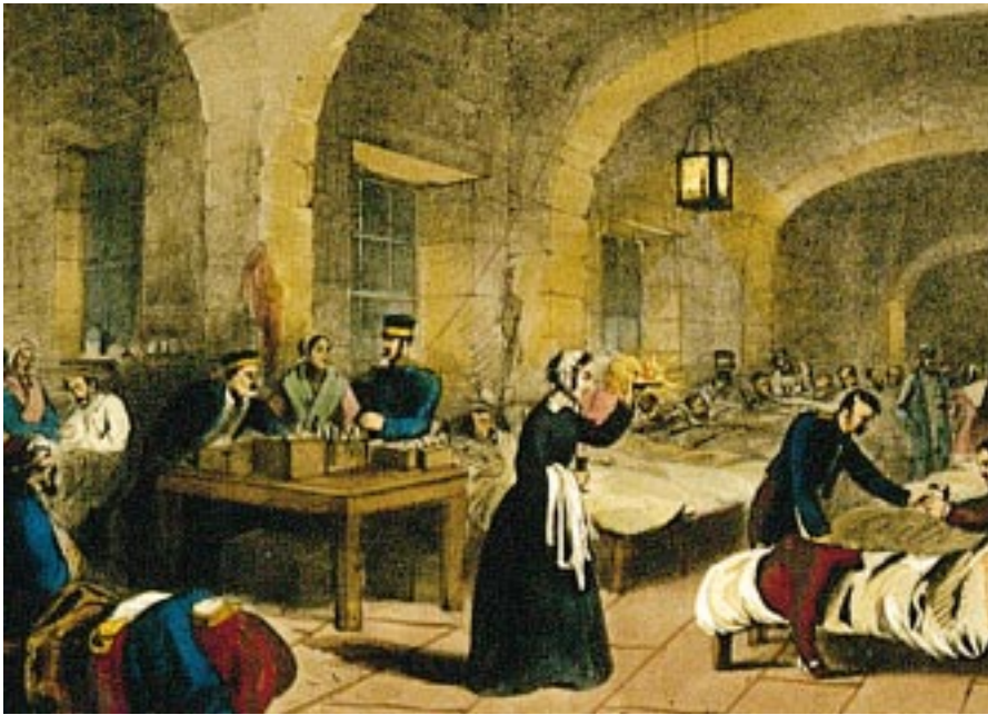
FLORENCE NIGHTINGALE AND THE NURSING PROFESSION. By her efforts in the Crimean War, the British nurse Florence Nightingale helped to make nursing a modern profession for middle-class women. She is shown here supervising her hospital at Scutari. Her attention to strict hygiene greatly reduced the death rate for wounded British soldiers.